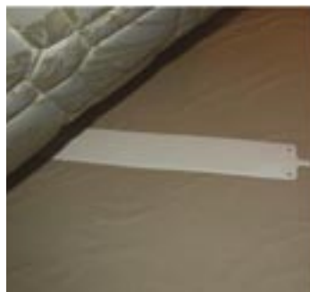
bed occupancy sensor