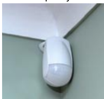
PIR activity sensor