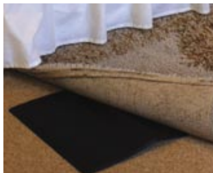
floor mat activity sensor