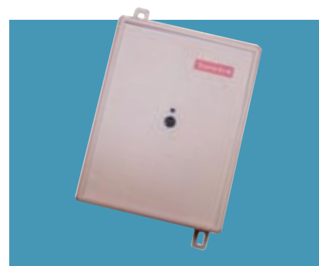
temperature extreme sensor