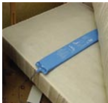
bed occupancy sensor