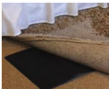
floor mat activity sensor