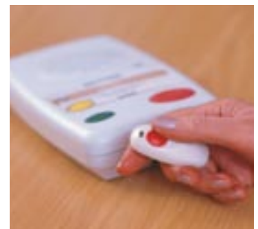
T400 & pendant