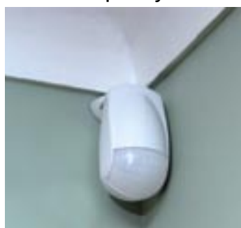
PIR activity sensor