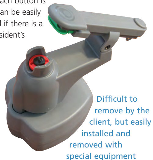
Difficult to remove by the client, but easily installed and removed with special equipment