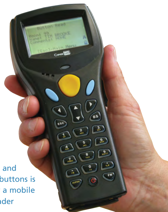
Programming and scanning the buttons is performed by a mobile hand-held reader