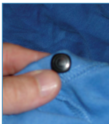
RFID button attached to item of clothing

The 11mm buttons are easily attached to clothing and each can be programmed to store up to 200 characters. This can include the person's name, unit, room number and any other information that they may wish to keep private. Some residents may have the MRSA infection which requires that their clothing be washed separately from others. Skin-related issues, such as eczema or an allergy to biological washing powder can be also included on the button. Members of staff do not need to keep asking residents for this information which maintains the resident's dignity and their privacy. Each button is reusable and can be easily reprogrammed if there is a change in a resident's circumstances.