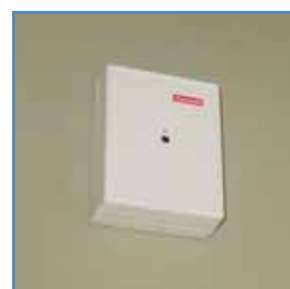
Temperature Extremes Sensor