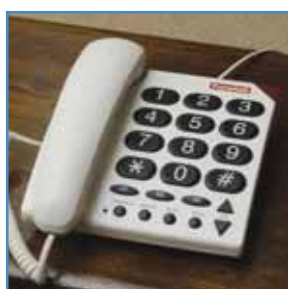
Big Button Telephone