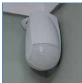
PIR (Movement Detector)